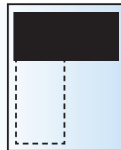
1/3rd of a Page Ad 3.5"h x 8.5"w or 11"w x 2.75"h