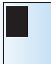
1/4 of a Page Ad 4.5" x 5.5"